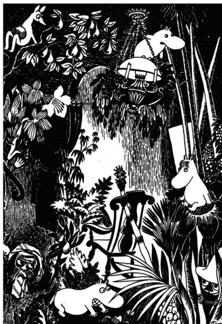
Photo 1. Book illustration (to the right) and the comic magazine illustration (to the left)