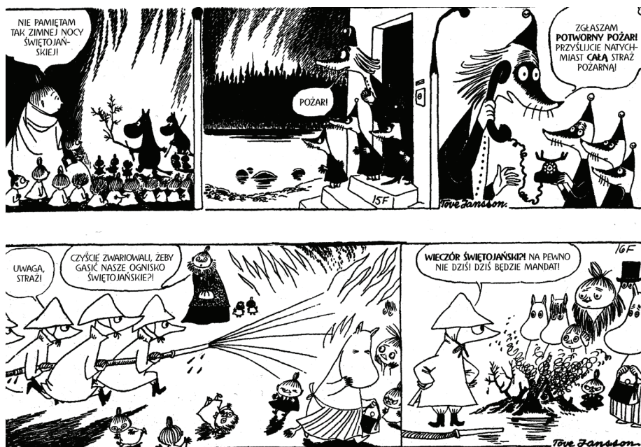
Photo 2. A comic frame layout in comic albums

The first proposed road concerning the structure and the visual aspect of the two albums and two copies of the Moomins magazine leads to a short summary of the above information. The album Moomin publications, i.e. Nowy dom Muminka and Wyspa Muminków refer to the original comic strips and stress the nature of the Moomin stories with their undeniable faithfulness to the black-and-white illustrations and regular layout of frames, set in strips. They are stories created and drawn by Tove Jansson, giving an inimitable atmosphere to her work, resulting from the use of lines, strokes and dots closely related to the text in the boxes. The magazine comic strips are more accessible (especially for a young reader), assuming as if a series form. It should be mentioned that in the 1990s, the series creators, “forcing the Moomin characters into their own animated film licence ( anime ), gave the family toy-like image to the inhabitants of the Finnish valley.” 12 The colourful illustrations and the varied form resulting from the variety of components proposed by Egmont to complement the comic strips were aimed at making the thirty-page volumes accessible, clear and undemanding.