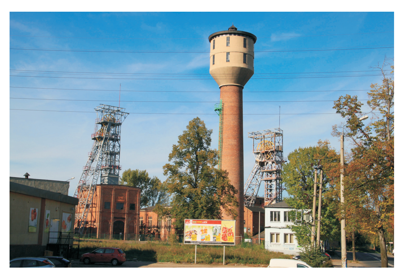
Fig. 3. The colliery Ignacy Hoym in Rybnik

token room, transformer and compressor buildings, storehouses and the 46-metre-high water tower. The tower was erected on a high hill, 306 metres above sea level, which is the highest point in the area and offers the best views in the neighbourhood (fig. 3). Mine "Ignacy" with post-mining landscapes varying in age may become a center of tourist traffic which could record the history of hard coal mining, where tourists could learn about the whole technological process of coal exploitation (Koncepcja..., 2000; Lamparska-Wieland, Rybałtowski, 2003).