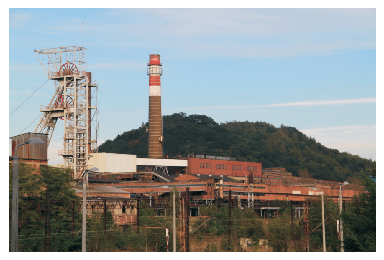
Fig. 2. The "Dębieńsko" mine in Czerwionka -Leszczyny

plan, consists of about 90 multi-family or public buildings with ridge roofs parallel to the road. Due to its high historic and architectural values, the whole concept has been entered into the register of historic monuments.