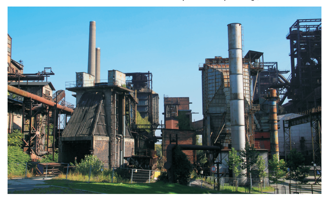
Fig. 5. The Vítkovice complex, Dolní Oblast

The Vitkovice steel works, located in the suburb of the same name near the city center, focuses on metallurgy and machine engineering (number 7, fig. 1, tab.1. fig 5). The Vitkovice Ironworks was built in Ostrava from 1828, following a suggestion made some 18 years earlier by the Scottish engineer John Baildon. Much of its finance was provided by Salomen Mayer Rothschild. The first iron was produced from its blast furnaces in 1832. A rolling mill for rails was completed in 1847, a Bessemer steel plant in 1866, and a tube mill in 1883. There were extensive engineering shops and by-product plants. In 1938 the plant employed 18,860 people, a total that rose to 33,477 by 1944. The blast furnaces were blown out in 1998, and the remaining parts of the business, concerned chiefly with mechanical and constructional engineering, were privatized 2003. Much of the disused plant, the Hlubina Colliery, the coke ovens and blast furnaces along Mistecka Street and the steel plant and rolling mill on Ruska Street, including many 19th century buildings, have been declared