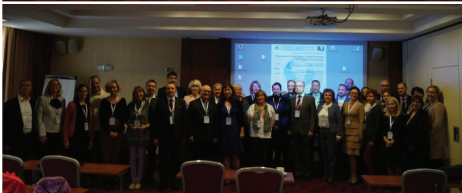
Figures 6, 7. Participants of the DLCC2018 conference and the EU IRNet project.