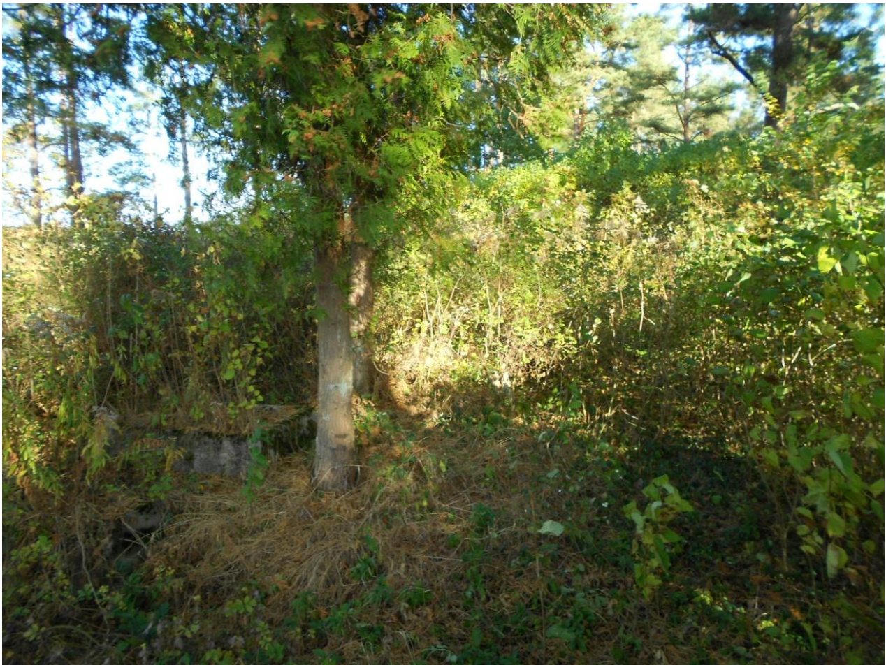
Fig. 3. An example of Thuja occidentalis at the Słabowo cemetery