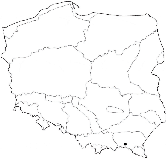
Fig. 1. Location of collection site of R. quinquecostatus .

Ryc. 1. Lokalizacja miejsca odłowu R. quinquecostatus .