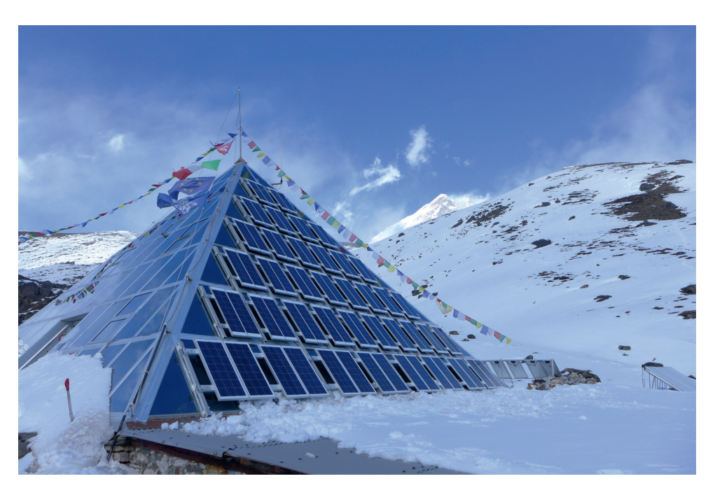
Figure 2. The almost 120 solar panels covering the pyramid form the most visible part of the complex system assuring the self-sufficiency of the station