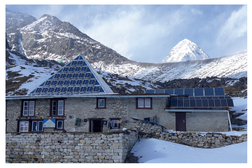
Figure 1. The Pyramid International Laboratory/Observatory inspired by the shape of the Mt. Pumori 7161 m a.s.l. (by K. Janecka)