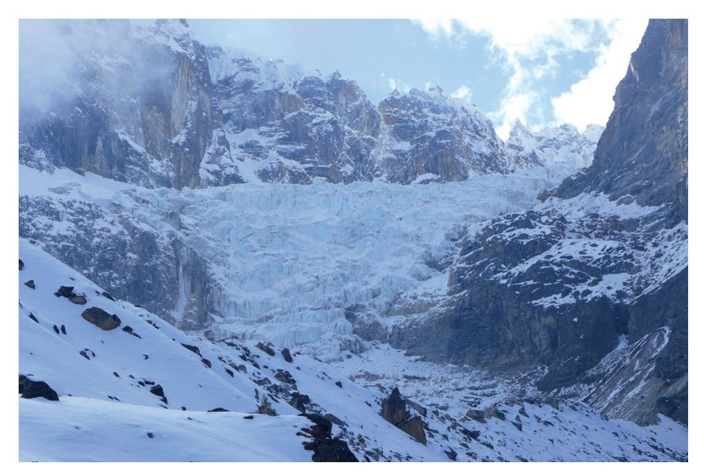
Figure 3. The Lobuche Glacier, a tributary of the Khumbu Valley (by K. Janecka)

Its precise location in the relatively small valley of the Lobuche Glacier, a tributary of the Khumbu Valley, provides access to the most popular Himalayan route leading to the Everest Base Camp while at the same time ensuring a quiet location away from crowds of tourists (Fig. 3). Since the building of the Pyramid, the research station has served as the base for more than 500 scientific projects on the high-mountain environment. Some of them, including the climate observatory (part of the GAW-WMO network), are associated with the permanent monitoring of climate change, glaciers, seismicity, pollution, soil, plant growth, tourist traffic etc. Some others are short-term projects