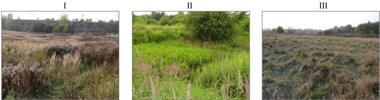
Fig. 2. Research area with occurrences of Calamagrostis epigejos : plots I – 30%, II – 15%, III – 5% (S. Koczyńska, 2011)

Plot I (N: 50°18'35.4"; E: 18°45'8.8") is located within unmown meadow and pasture and Phragmites australis (Cav.) Trin. ex Steud. dominates the land-surface in the southern part. The southern boundary of the plot is delineated by a railway embankment with clusters of woody species, including Populus nigra L. 'Italica', Aesculus hippocastanum L., Salix alba L., Acer platanoides L. and Sambucus nigra , and the embankments themselves are covered with Crataegus monogyna .