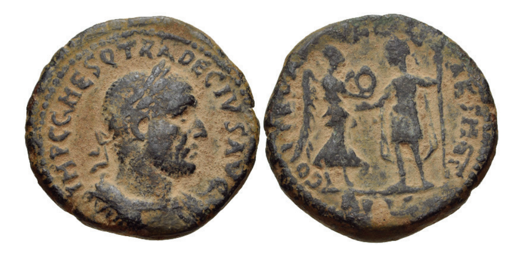
Fig. 5. Æ, Caesarea Maritima (Samaria), Trajan Decius, (249–251 AD); obv.: IMP C C MES Q TRA(I) DECIVS AVG, laureate and cuirassed bust, r.; rv.: COL PR F AVG F C CAES MET / R PSP, emperor standing, l., holding spear, receiving wreath from Victory / Nike standing r.; cf. RPC 9, no 2058 [www.cngcoins.com/Coin.aspx?CoinID=151101]