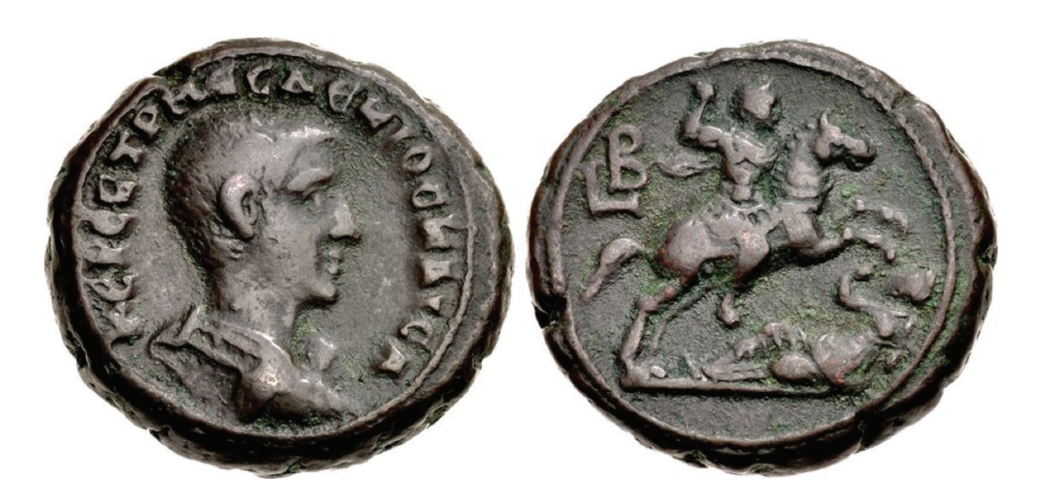
Fig. 1. Tetradrachm, Alexandria (Egypt), Trajan Decius (Herennius Etruscus), 250/251 AD; obv.: K εPε εTP ΜεC ΔεΚΙΟC KAICA, bareheaded, draped, and cuirassed bust, r.; rv.: caesar on horseback galloping, r., thrusting spear at fallen enemy below horse / L B; cf. RPC 9, no 2290 [www.cngcoins.com/Coin.aspx?CoinID=381421]