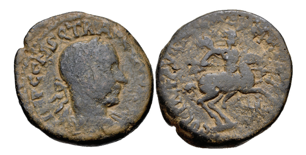
Fig. 2. Æ, Caesarea Maritima (Samaria), Trajan Decius, (249–251 AD); obv.: IMP C C MS Q TRA DECIVS AVG, laureate, draped and cuirassed bust, r.; obv.: COL PR F AV[G F C CAES MET PR S P], emperor riding on galloping horse, r., holding transverse spear; below, at r., small enemy; cf. RPC 9, no 2057 [www.cngcoins.com/Coin.aspx?CoinID=290511]