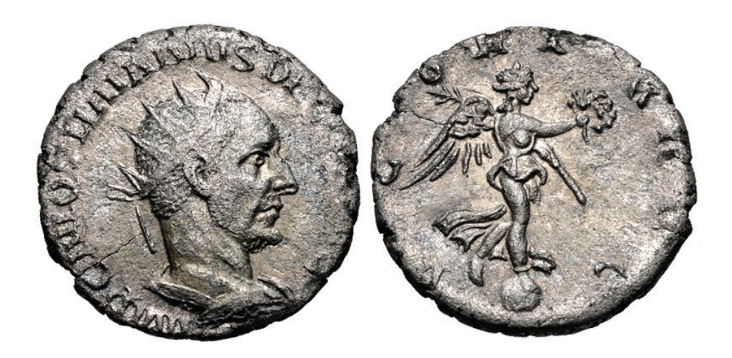
Fig. 8. Ant, Antioch?, Trajan Decius, 251 AD; obv.: IMP C M Q TRAIANVS DE[CIVS AVG], radiate and cuirassed bust, r.; rv.: V[I]C[T]ORIA AVC, Victory standing on globe, r., holding wreath and palm [www.cngcoins.com/Coin.aspx?CoinID=250028]