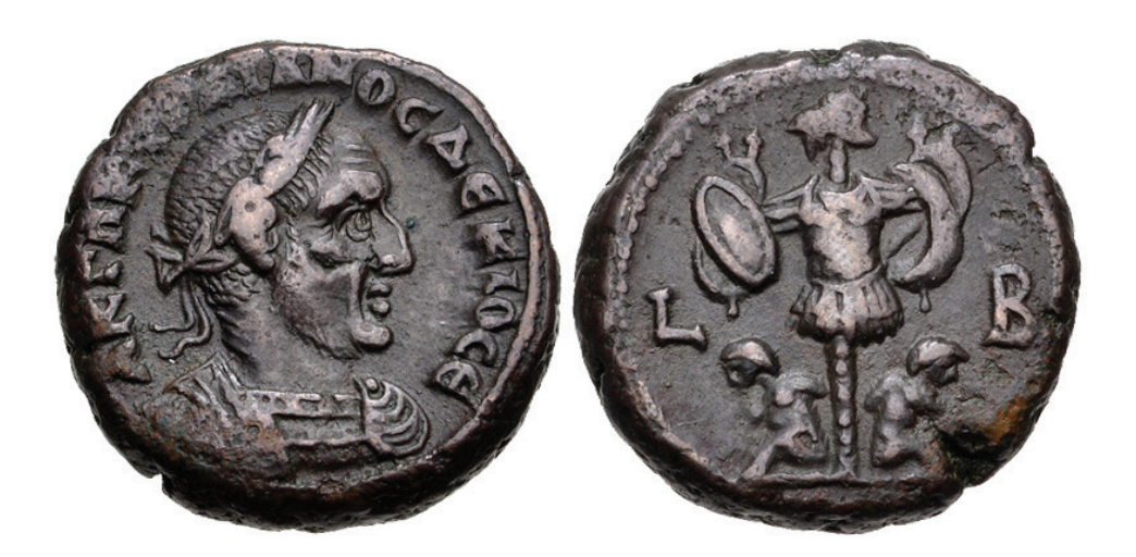
Fig. 4. Tetradrachm, Alexandria (Egypt), Trajan Decius, 250/251 AD; obv.: A K \Gamma M K TPAIANOC ΔεΚΙΟC \varepsilon , laureate and cuirassed bust, r.; rv.: trophy with two captives / L B; cf. RPC 9, no 2280 [www.cngcoins.com/Coin.aspx?CoinID=306427]