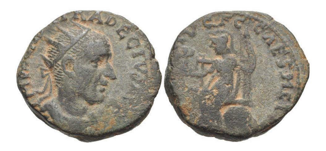
Fig. 7. Æ, Caesarea Maritima (Samaria), Trajan Decius, (249–251 AD); obv.: IMP C C MES Q TRAIANVS DECIVS AVG, radiate and draped bust, r.; rv.: [COL PR F] AVG F C CAES METRO, Roma seated, l., on shield, holding Nike and spear; cf. RPC 9, no 2065 [www.cngcoins.com/Coin.aspx?CoinID=139067]