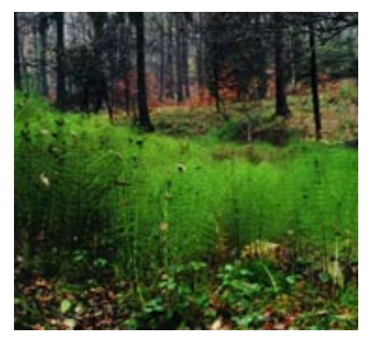
Fig. 4. Large field of giant horsetail Equisetum telmateia at the Horsetail stream.

bed or the association between different wood species and the level of ground water. In the lowest place of the slope there occurs Alnus glutinosa, which tolerates high ground water level, then gradually Fraxinus excelsior takes over, whereas at the top of the slope Carpinus betulus and Quercus robur dominate. This observation helps to strengthen our understanding of habit requirements of different species.