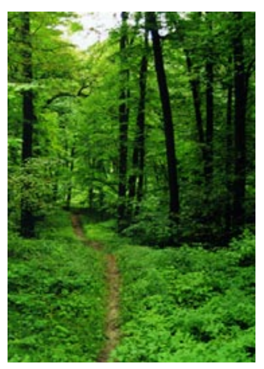
Fig. 3. Oak – hornbeam forest in the central part of Arboretum.

sii and Lilium martagon. At a higher location of Arboretum the woods are formed of 150year-old Pinus silvestris and Quercus petraea. Betula verrucosa, Tilia cordata and Quercus robur are less abundant and form together with Pinus silvestris and Quercus petraea a community called acid oak forest. This community, formerly commonly present, nowadays, due to antropogenical changes is more like the continental mixed coniferous forest.