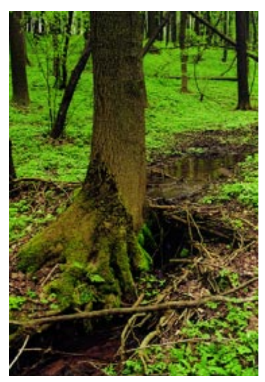
Fig. 2. Riverside forest with ash and alder at the Lilly Stream.

The main type of forest in the Arboretum is deciduous oak-hornbeam forest with dominating oaks (Q. robur, Q. petrea), lime (Tilia cordata), hornbeam (Carpinus betulus), ash (Fraxinus excelsior) and maple (Acer pseudoplatanus) (Fig. 3). The undergrowth is formed by hazel (Corylus avellana), Cornus sanguinea, Euonymus europeus, Sambucus nigra. The floor covering is very rich and colorful. There occur Corydalis cava, Pulmonaria obscura, Primula elatior, Anemone nemorosa. Large fields of bear garlic, Allium ursinum give off a strong smell in the spring. Later, visitors can find Convallaria maialis, Gallium schulte-