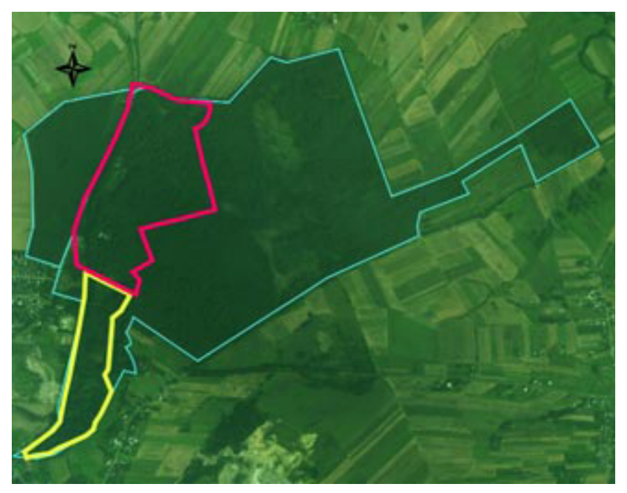
Fig. 1. Airplane photograph of Arboretum of Moravian Gate (outlined with blue line) with educational paths: ecological path marked with red line, dendrological path marked with yellow line.

est is separated from open area by a dense belt made of bushes and young trees (among them Prunus spinosa, Cornus sanguinea, Rosa can ina ), which effectively stops strong winds, protecting the interior of the forest. This community is a shelter for many animal species. Plenty of insects feed on the pollen and nectar during flowering season, and in the late summer and autumn birds and small mammals find abundance of fruits there.