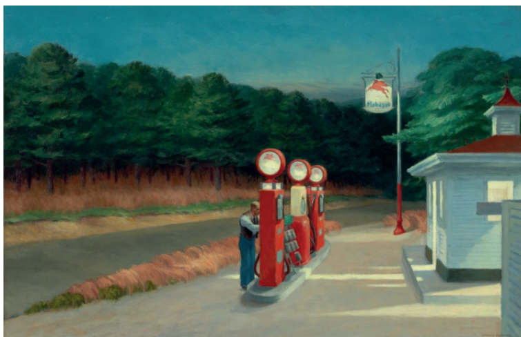
Fig. 1. Edward Hopper, Gas (1940).

The first painting to be discussed is Gas (1940), an oil on canvas with dimensions of 26 1/4 x 40 1/4" (66.7 x 102.2 cm); the work belongs to Museum of Modern Art in New York.