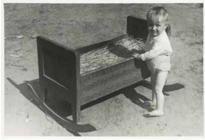
Photograph No. 8: Photograph PAE/F/33.25.VIII/832.65.25/01 – Paszki Małe (near Radzyń Podlaski) – a ground cradle, source: http://www.pae.us.edu.pl/items/show/12772 , access: 10.07.2020.

the cradle fits into the thematic area of material culture, related to household accessories. A child in the photograph taken in 1966 in Książnica Śląska (near Dzierżonów) not only demonstrates “its own” cradle, but indirectly shows its play-related use. Putting the closest objects into motion is one of the first games a child can play alone.