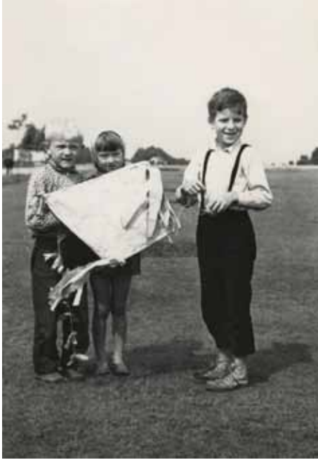
Photograph No. 11: Photograph PAE/F/29.33. III/1213.69.28/01 – Łysaków (near Mielec) – children’s clothing, source: http://www.pae.us.edu.pl/items/show/10438 , access: 10.07.2020.