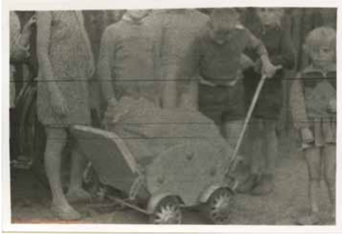
Photograph No. 3: Photograph PAE/F/7.24.VIII/1192.61.16/01 – Jasień (near Lubsko) – a children’s cart, source: http://www.pae.us.edu.pl/items/show/619 , access: 10.07.2020.