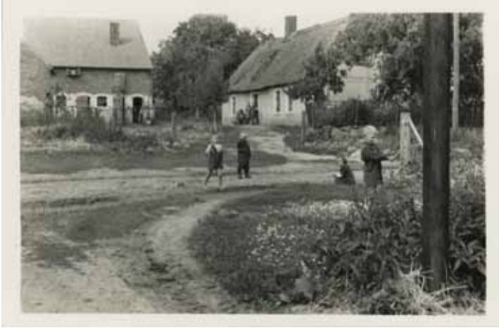
Photograph No. 12: Photograph PAE/F/15.9.IV/12.56.9/01 – Objazda (near Słupsk) – a rural road, source: http://www.pae.us.edu.pl/items/show/3233 , access: 10.07.2020.

Another set of photographs worth mentioning includes those in which children act as “models”. They are presenting an object, probably at the researcher’s bidding, to either demonstrate how it is used or make it more visible in the photograph.