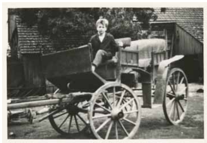
Photograph No. 15: Photograph PAE/F/7.23.VIII/457.61.11/01 – Kopce / Koperno (near Gubin) – a four-wheel open cart, source: http://www.pae.us.edu.pl/items/show/553 , access: 10.07.2020.

The PAE photos from the “Transportation and communication” section provide information not only about the playtime use of the aforementioned sleds and carts, or a children’s game, particularly enjoyed by older children, of pretending to be a coachman. The photos also document skates (14 photographs), wooden skis (3 photographs), and stilts (4 photographs). Children used the latter for fun. The PAE archives contain no photos of children using skates or skis. However, one photograph that