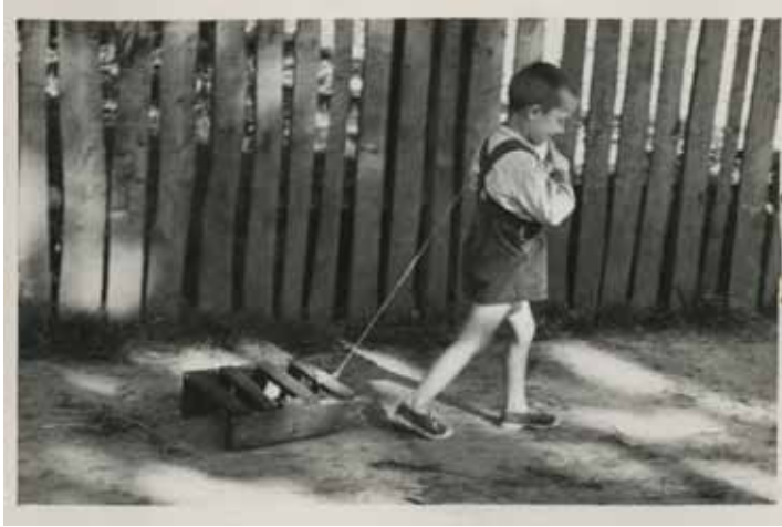
Photograph No. 5: Photograph PAE/F/27.16.VIII/423.61.10/01 – Przeździek Wielki (near Szczytno) – a sled, source: http://www.pae.us.edu.pl/items/show/9353 , access: 10.07.2020.

Amongst 21 photographs of sleds 12 with varying structures, documented in numerous towns and villages in the country, there was only one, in two different shots, taken in the winter scenery. One picture, taken in the village of Przeździek Wielki (near Szczytno), stands out from this group of photographs. It depicts a 4–5 year old boy dressed in summer clothes, walking along a fence and dragging a small wooden sled with a string tossed across his shoulder (photograph No. 5).