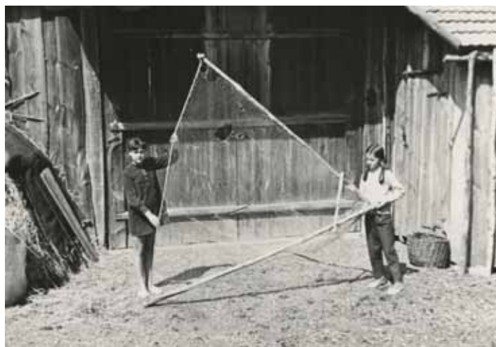
Photograph No. 14: Photograph PAE/F/31.26.XV/1292.71.5/01 – Kazimierz (near Puławy) – fishing nets