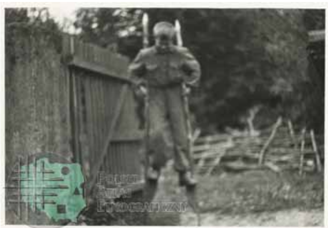
Photograph No. 17: Photograph PAE/F/28.14.XIII/344.61.9/01 – Grom (near Szczytno) – stilts, source: http://www.pae.us.edu.pl/items/show/9608 , access: 10.07.2020.

successfully shows the ludic nature of stilts was discovered. The photo was taken in 1961 in the town of Grom (near Szczytno). It is barely noticeable that a 10–12 year old boy is smiling while demonstrating the use of stilts ( chodzydła ) which shows that this rural tool was used as a source of entertainment for children. This becomes quite apparent when the photo of the boy is compared with the photo in which an older man demonstrates the stilts (photographs No. 17 and 18).