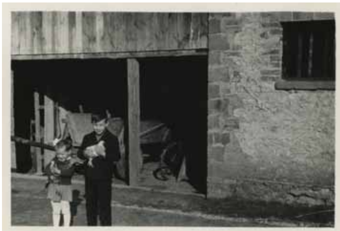
Photograph No. 10: Photograph PAE/F/21.30.IV/473.62.34/01 – Lubojna (near Częstochowa) – a children's outfit, source: http://www.pae.us.edu.pl/items/show/6310 , access: 10.07.2020.

The picture of two children, taken in 1962 in Lubojna (near Częstochowa), is equally interesting. The photograph, which was also supposed to document the outfit of a young girl and a slightly older boy, was taken from a relatively large distance against the background of a building which dominated the frame. Due to the way the picture was taken, a person looking at it, instead of focusing on the clothes from that period of time, would instead try to establish what the children are holding in their hands. The answer is farm animals, which is obvious if the photograph is magnified (photograph No. 10).