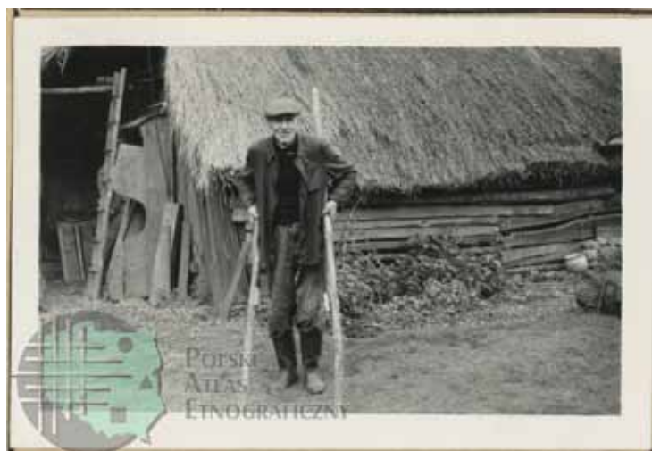
Photograph No. 18: Photograph PAE/F/21.30.IV/473.62.7/01 – Lubojna (near Częstochowa) – stilts