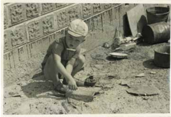
Photograph No. 9: Photograph PAE/F/22.20.XIII/1099.68.18/01 – Wola Nakonowska (near Włocławek) – a children's outfit, source: http://www.pae.us.edu.pl/items/show/6584 , access: 10.07.2020.

The picture of two children, taken in 1962 in Lubojna (near Częstochowa), is equally interesting. The photograph, which was also supposed to document the outfit of a young girl and a slightly older boy, was taken from a relatively large distance against the background of a building which dominated the frame. Due to the way the picture was taken, a person looking at it, instead of focusing on the clothes from that period of time, would instead try to establish what the children are holding in their hands. The answer is farm animals, which is obvious if the photograph is magnified (photograph No. 10).