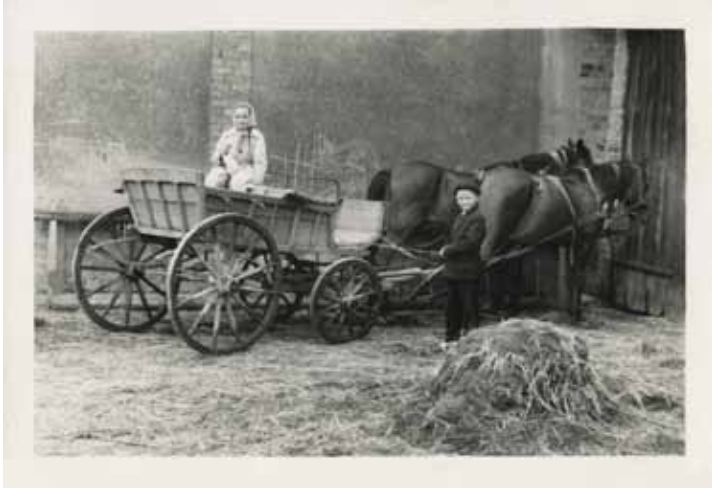
Photograph No. 16: Photograph PAE/F/13.20.IX/491.62.19/01 – Wilczyna (near Szamotuly) – a four-wheel open cart

successfully shows the ludic nature of stilts was discovered. The photo was taken in 1961 in the town of Grom (near Szczytno). It is barely noticeable that a 10–12 year old boy is smiling while demonstrating the use of stilts ( chodzydła ) which shows that this rural tool was used as a source of entertainment for children. This becomes quite apparent when the photo of the boy is compared with the photo in which an older man demonstrates the stilts (photographs No. 17 and 18).