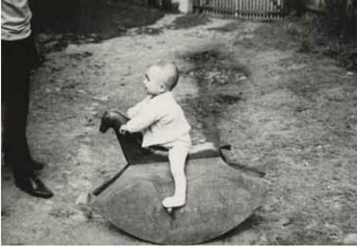
Photograph No. 6: Photograph PAE/F/26.27.II/1212.69.15/01 – Radzice Duże (near Opoczno) – a rocking horse, source: http://www.pae.us.edu.pl/items/show/9070 , access: 10.07.2020.

(near Opoczno), depicts a child using the toy, either captured by accident or purposefully “directed” by the researcher (photograph No. 6).