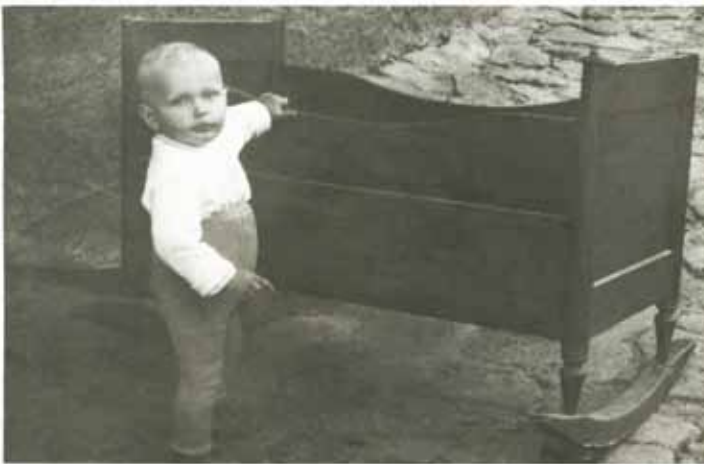
Photograph No. 7: Photograph PAE/F/13.30.I/1018.66.16/01 – Książnica Śląska (near Dzierżoniów) – a ground cradle, source: http://www.pae.us.edu.pl/items/show/2492 , access: 10.07.2020.

A cradle is not a toy as opposed to a rocking horse, which is a toy, even though the browser saw no correlation between it and the search term “toy”. A cradle is rather an object used in the early childhood period. Within the electronic PAE resources