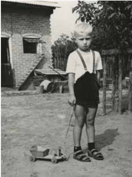
Photograph No. 1: Photograph PAE/ F/32.31.X/1215.69.33/01 – Jastkowice (near Tarnobrzeg) – children’s clothes, source: http://www.pae.us.edu.pl/items/show/12159 , access: 10.07.2020.

Working with archival iconographic material always involves methodological and interpretational difficulties. In the case of the digitalised PAE collection, available descriptions are often insufficient 10 . Doubts arise whether the way of interpreting the photos is correct and exhaustive 11 . Since the Digital Archives of the PAE enable quick access to over twelve thousand photos, the first step of every preliminary research is to choose the terms to be entered into the search engine on the archive website. Terminology connected with ludic issues was found useful when searching for photos depicting rural children’s toys and games in the PAE material, but, as numerous attempts have proved, it is not the only keyword that brings results worth discussing.