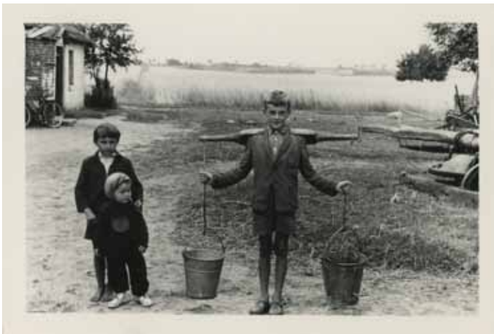
Photograph No. 13: Photograph PAE/F/20.21.III/400.61.24/01 – Orle (near Radziejów) – on-person transport, source: http://www.pae.us.edu.pl/items/show/5311 , access: 10.07.2020.

The photographs show that the children were clearly having fun posing and demonstrating their clothes as well as demonstrating how on-person transport with carrying shoulder poles worked (photograph No. 13), presenting fishing nets (photograph No. 14), or “demonstrating an open carriage” (photograph No. 15, 16). The below photographs were taken in the early 1960s.