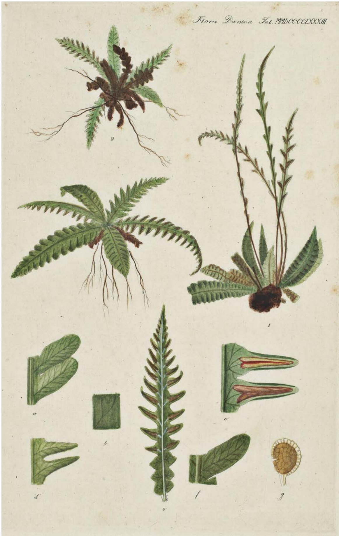
Fig. 1 The Plate 2983 from Flora Danica [8] with the Blechnum spicant var. fallax (Illustration 2 in top left part of the plate).